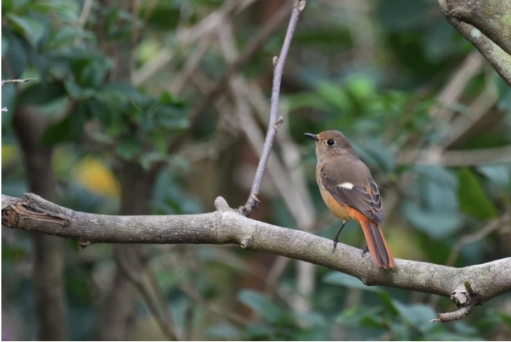
216. Daurian Redstart Phoenicurus aureus – Common, seen daily from Nov 7-17. First seen at Yangcheng (Nov 7).