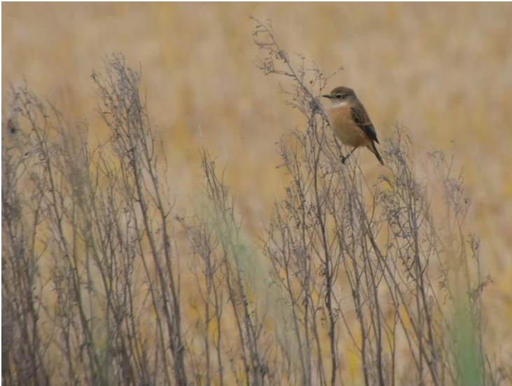
217. Stejneger's Stonechat Saxicola stejnegeri – Seen on 4 days, first seen and most common at Yangcheng (Nov 7).