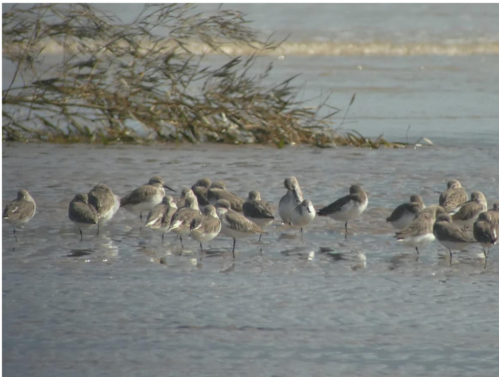
95. Spoon-billed Sandpiper Eurynorhynchus pygmeus - For me the bird of the trip. A really small wader, difficult to find in a large mixed flock simply because all others waders are larger. Very whitish in winter plumage, spatula shape of bill not easy to see, especially not from the side. In “mixed” flock with Dunlin, Red-necked Stint, etc.– Critically endangered (CITES), total population estimated at 240 – 400 birds, decreasing.