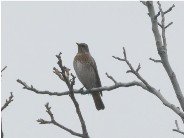
202. Red-throated Thrush Turdus ruficollis – Excellent views of an adult bird at the Ming Tombs (Nov 6).