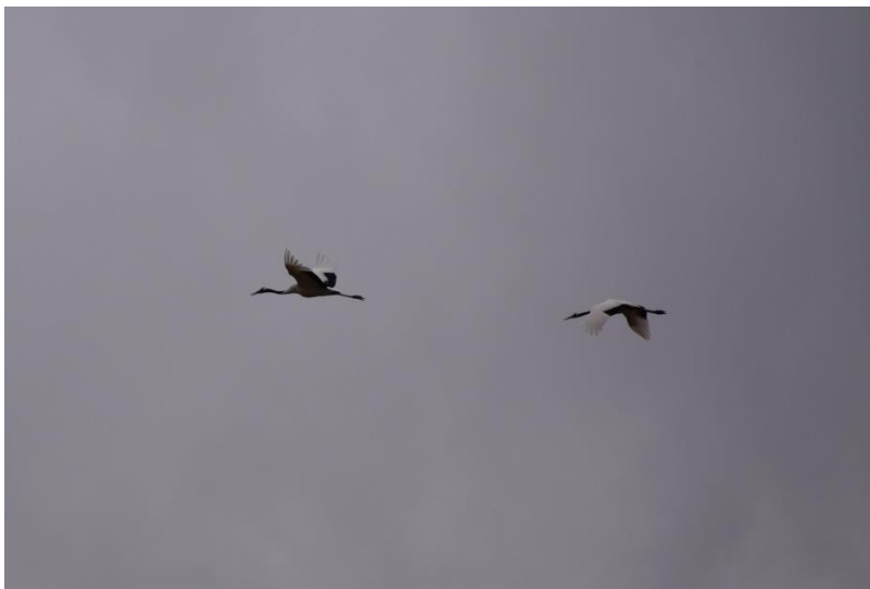
66. Red-crowned (Japanese) Crane Grus japonensis – Seen daily at the Yancheng Nature Reserve (Nov 7-9), highest count 62 birds on Nov 9. Endangered (CITES). Total population estimated at 1,830 birds.