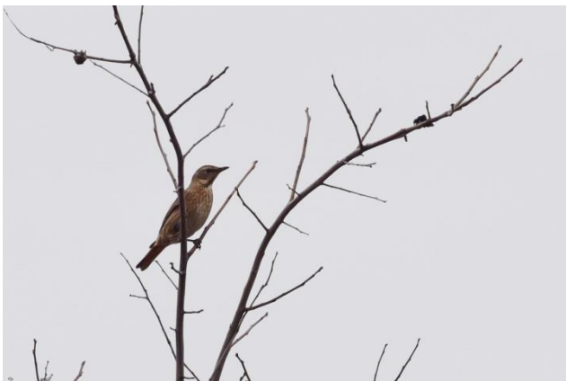
203. Naumann's Thrush Turdus naumanni – Seen on 3 days, most common at the Ming Tombs (Nov 6).