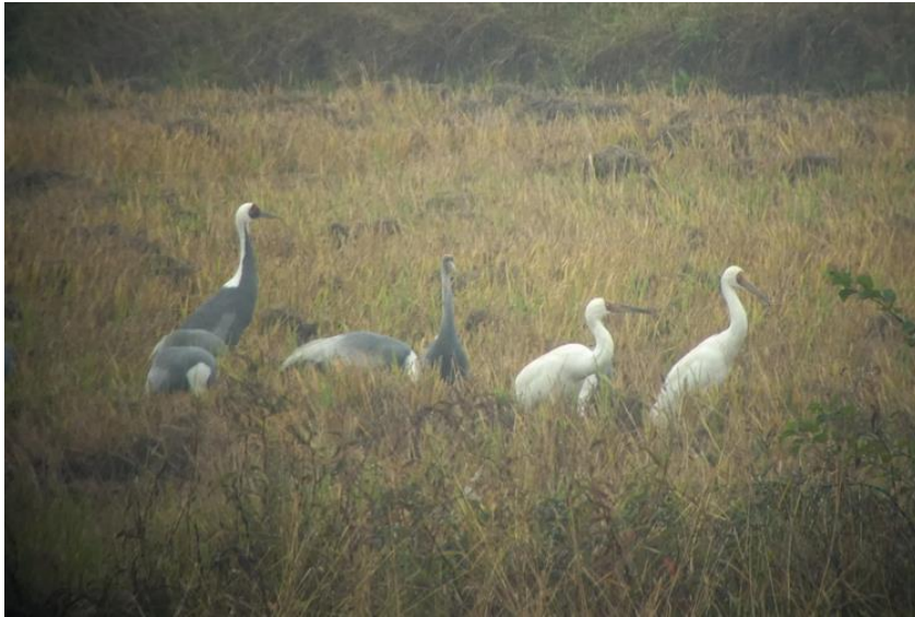
65. White-naped Crane Grus vipio – A total of about 100 birds at Poyang (Nov 13). Vulnerable (CITES). Total population estimated at 3,700 -4,500 birds, decreasing.