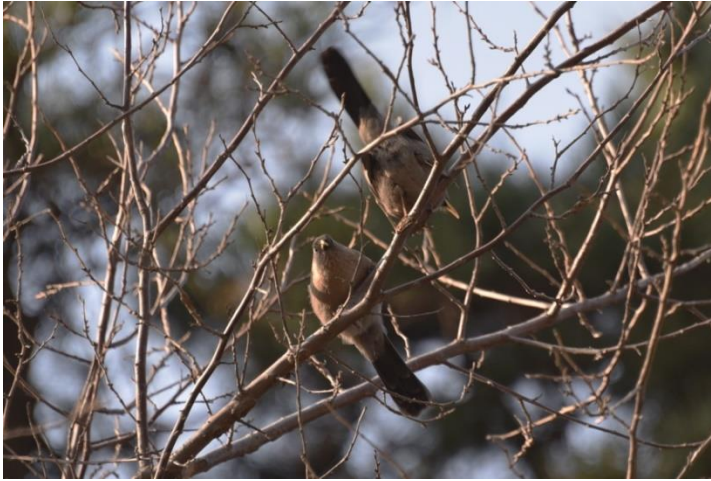
181. Plain (Pere David's) Laughingthrush Garrulax davidi – About 10 birds at Badaling (Nov 5) and 2 birds at the Ming Tombs (Nov 6).