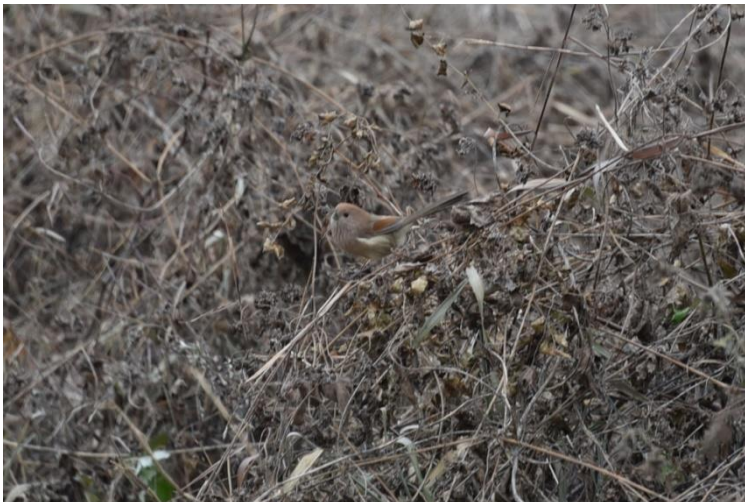
184. Vinous-throated Parrotbill Sinosuthora webbiana – Common, first seen –at least 50 birds- at Badaling (Nov 5).