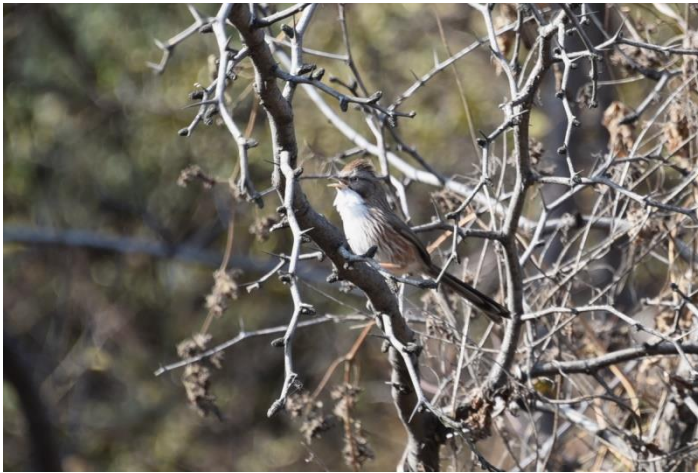
183. Beijing Babbler Rhopophilus pekinensis – Common at both Badaling (Nov 5) and Ming Tombs (Nov 6).