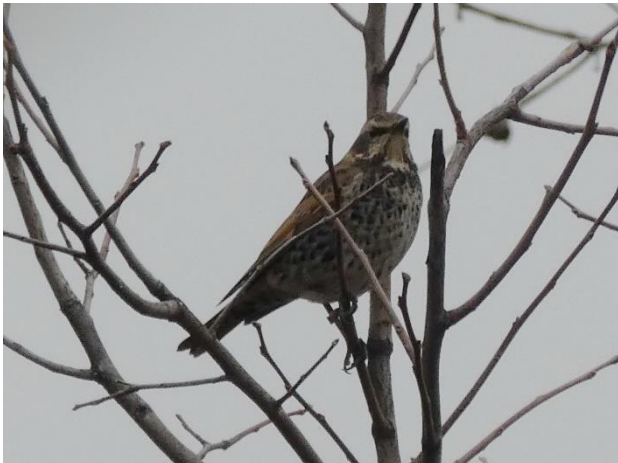
204. Dusky Thrush Turdus eunomus – As previous species.